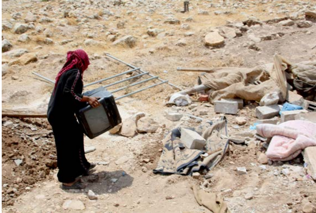
Children inspect the wreckage after Israeli authorities demolished a number of Palestinian homes built without a permit in the village of Umm Al-Khair in the occupied West Bank, on 9 August 2016