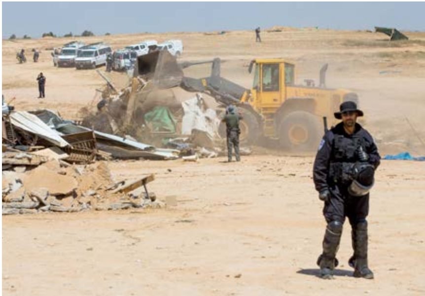
© ← An Israeli police officer watches as a bulldozer demolishes a Bedouin family's house in the unrecognized village of Al-Araqib in the Negev/Naqab region of Israel, on 12 June 2014 © Active Stills