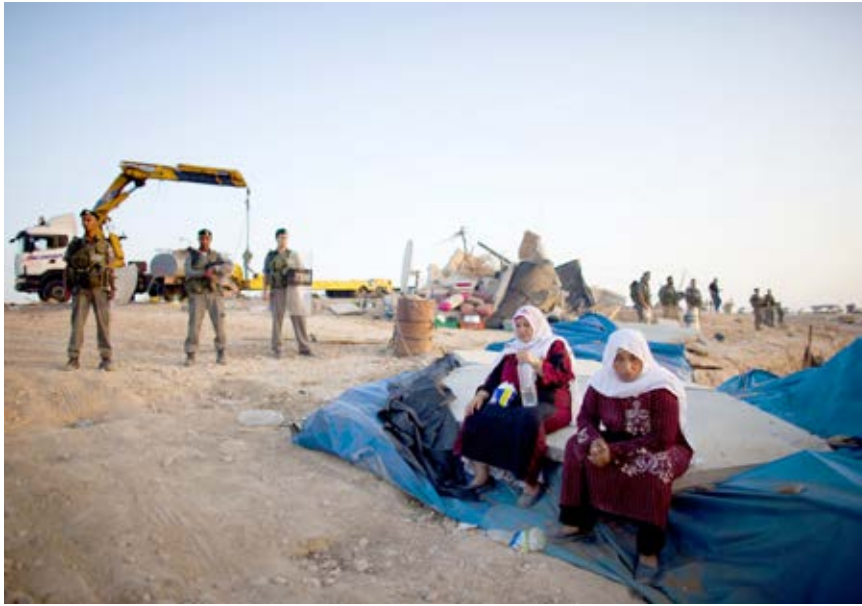
© ← Israeli border policemen stand guard as Bedouin women sit on what was left from their house as Israeli authorities arrive to destroy temporary houses in the unrecognized village of Al-Araqib in the Negev/Naqab region of Israel, on 10 August 2010 © Uriel Sinai / Getty Images